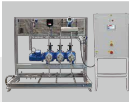
Lewa Butane Pump