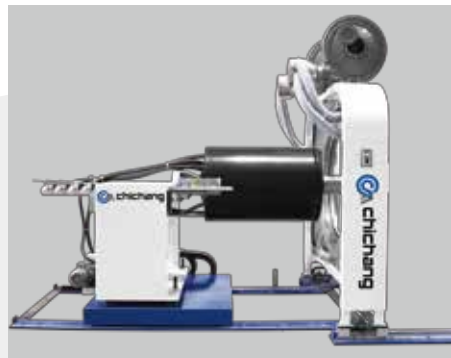
Air Cooling Ring & Forming Mandrel