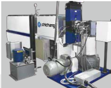
Gear Pump & Non-Stop Screen Changer